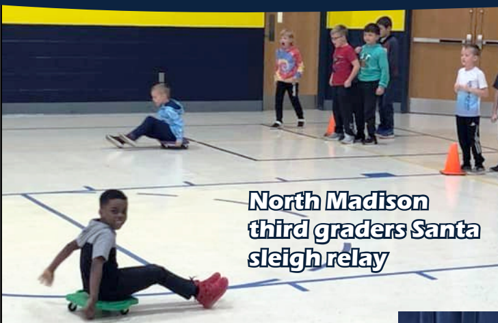
North Madison third graders Santa sleigh relay