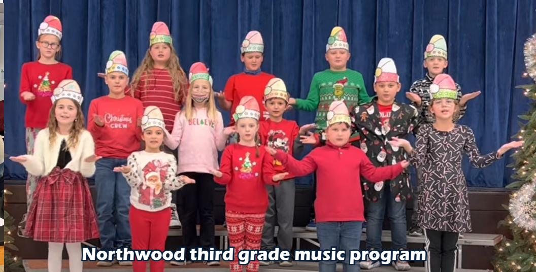
Northwood third grade music program