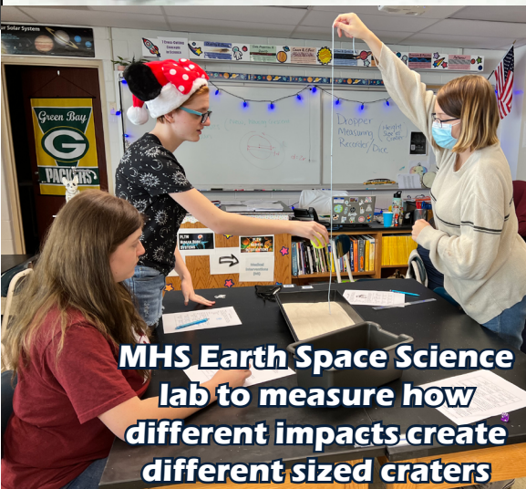
MHS Earth Space Science lab to measure how different impacts create different sized craters