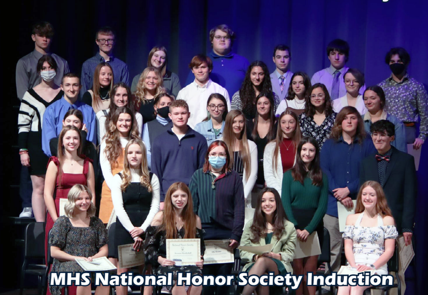
MHS National Honor Society Induction