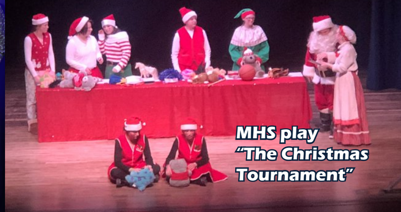
MHS play "The Christmas Tournament"